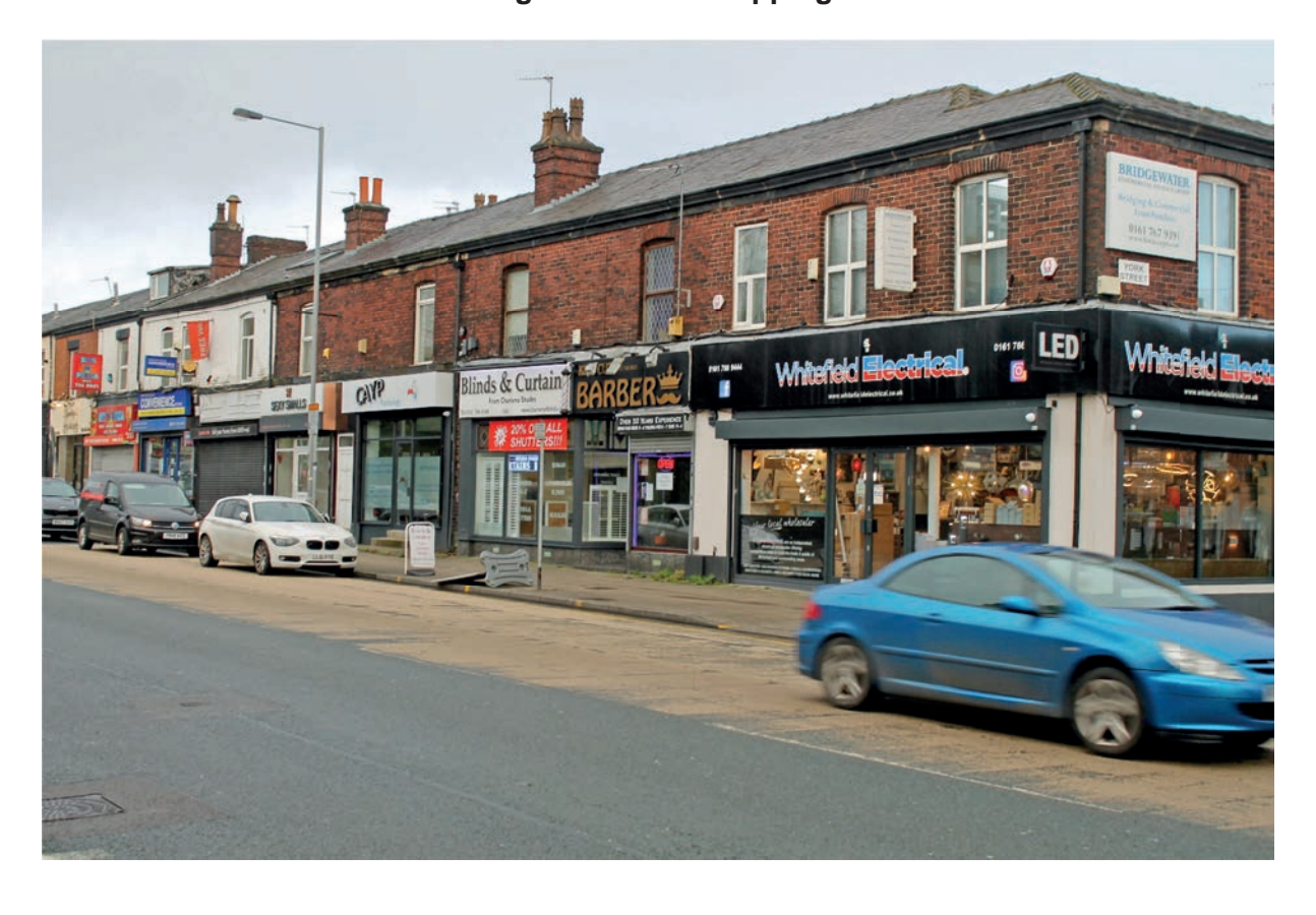
Fig. 2.5 for Question 2 Local neighbourhood shopping centre